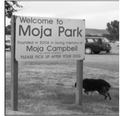
Welcome to Moja Campbell Park

Moja Park's benefits to the community are many. Numerous dog behavior problems can be eliminated or prevented by regular exercise and socialization at the park, which is easily accessible by walking or driving. Our former shelter dogs love visiting old friends and making new ones at the dog park. Check it out with your canine companion today!