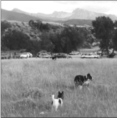
Shelter alumni enjoy Moja Park

In 2006, the park was dedicated to the memory of Moja Campbell, one of the dogs who had so enjoyed